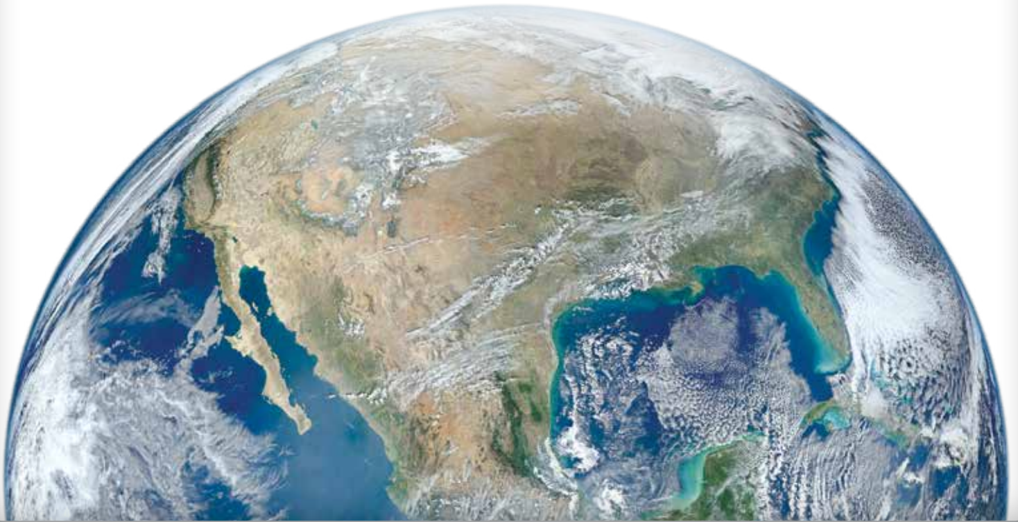
"Blue Marble" image of Earth captured by Raytheon's Visible Infrared Imaging Radiometer Suite.

FOR OVER 90 YEARS, RAYTHEON HAS ENABLED COUNTLESS MISSIONS BY REMAINING COMMITTED TO A SINGLE ONE: CUSTOMER SUCCESS. FROM THE DEPTHS OF THE OCEAN TO THE FARTHEST REACHES OF SPACE, FROM REMOTE BATTLEFIELDS TO THE VIRTUAL REALMS OF CYBERSPACE, RAYTHEON TECHNOLOGIES ARE DEPLOYED IN MORE THAN 80 COUNTRIES TO DELIVER INNOVATION IN ALL DOMAINS.