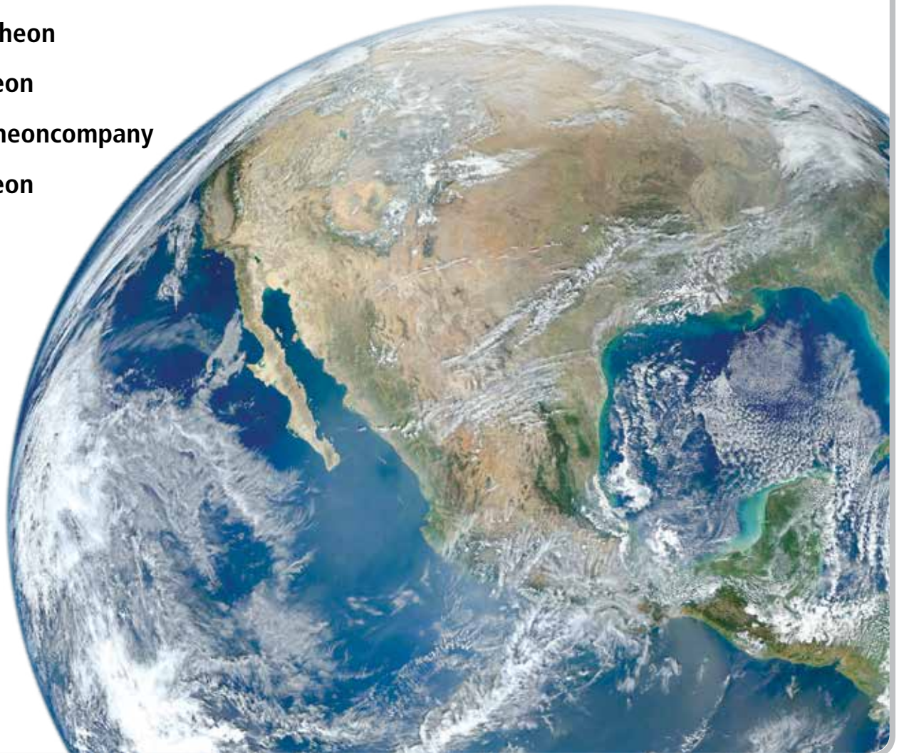
"Blue Marble" image of Earth captured by Raytheon's Visible Infrared Imaging Radiometer Suite.