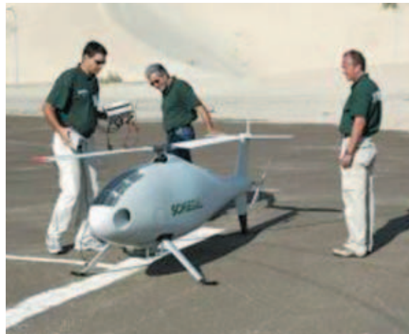
Schiebel - VTOL UAV Camcopter S-100

Austrian UAV company Schiebel and Australian UAV operator Helimetrex have teamed to offer a VTOL UAV for both civil and military applications. The Camcopter® S-100 has been designed and produced to operate in maritime environments, incorporating materials and coatings to prevent corrosion in saltwater environments. The vehicle's VTOL capabilities, combined with precision navigation systems makes it ideal for maritime roles including ship-based targeted surveillance and search and rescue.