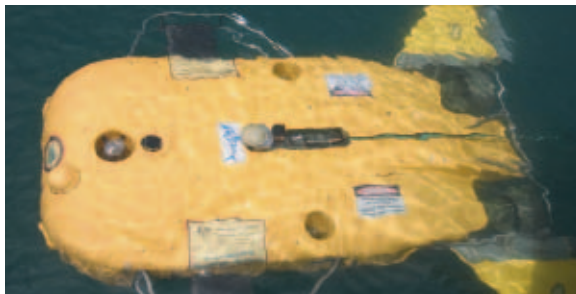
DSTO - Wayamba UUV

Two vehicles, called Wayamba and Mullaya, have been developed as test beds for field experiments and the testing of technologies which could address the critical path issues. The test beds are also being used to demonstrate different concepts of operation, such as multiple vehicle co-operation in integrated air-undersea operations and multiple-undersea vehicle operations.