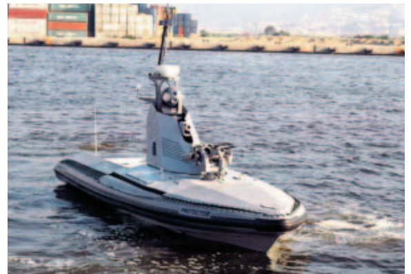
RAFAEL - Protector USV

USVs are highly maneuverable and stealthy craft with a wide range of capabilities to operate in high risk environments: target drones; ISR; covert estuarine operations; mine & anti-submarine warfare; stabilised weapons platform.