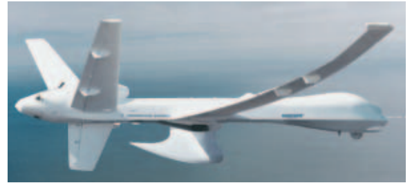
General Atomics Aeronautical Systems - Mariner

UUVs extend the range and stealth capabilities of naval ships and submarines, especially in mine detection and surveillance roles in harbours or littoral waters.