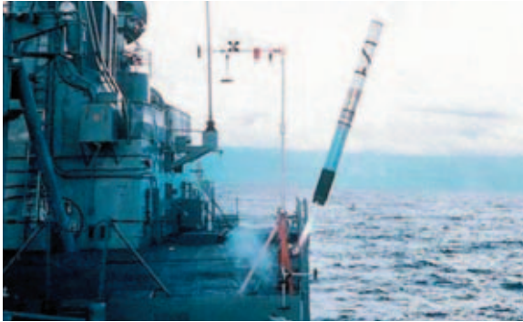
Nulka - Anti-Ship Missile Defence Decoy

Defence, customs and industry agencies are now investing heavily in the development and use of various Unmanned Marine Vehicles (UMV) for tactical surveillance and defence roles.